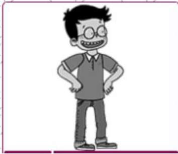
short black hair