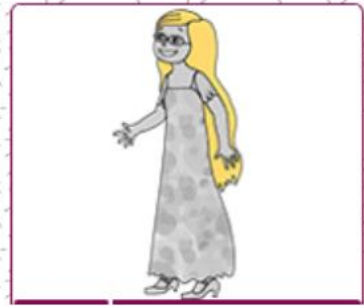
long blond hair